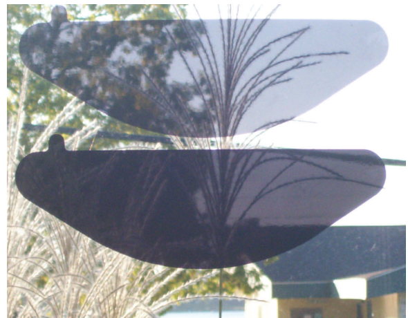
UNIVERSAL HELMET TINT-A-SHIELD