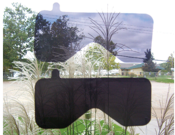
UNIVERSAL GOGGLE TINT-A-SHIELD

LIGHT TINT ALLOWS 20% OF LIGHT THROUGH DARK TINT ALLOWS 5% OF LIGHT THROUGH